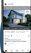
Listing Social Post