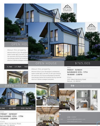
Open House Items